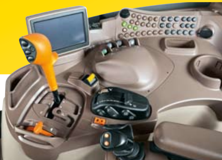
AutoQuad/PowrQuad console Optimal transmission control is within easy reach.