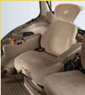
The optional Hydraulic Cab Suspension comes with the Super Comfort Seat featuring adjustable backrest.

The newly designed slender engine bonnet and wraparound visibility let you keep a close watch on your work whether it's ahead, above, below, to the sides or behind.