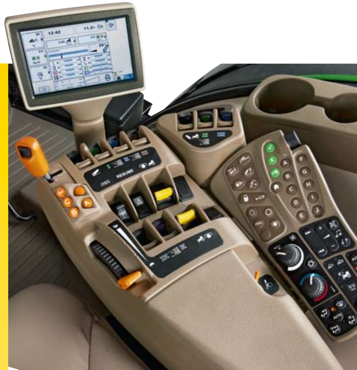
The new CommandArm console Enjoy fingertip control of the main tractor and cab functions. Use the CommandCenter display to operate AMS functions like AutoTrac, optionally available with a touch screen and video function.

*7R Series tractors equipped with PowrQuad or AutoQuad transmissions come with a different right-hand control console