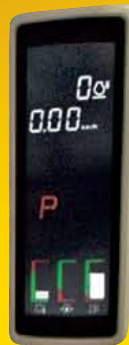
Corner post display The illuminated Corner Post Display puts critical performance data within easy view.