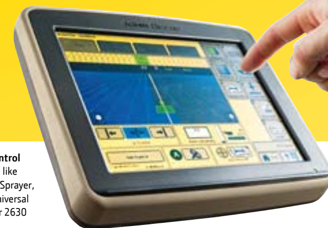
Advanced guidance and control AMS Guidance Pro Modules like iSteer and iGuide as well as Sprayer, Spreader and Seeder Pro Universal can be run on the GreenStar 2630 display.