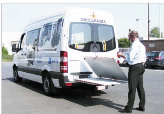
DH-LSPZ 300-500 kg