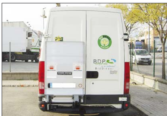
DH-LCZ 500-750 kg