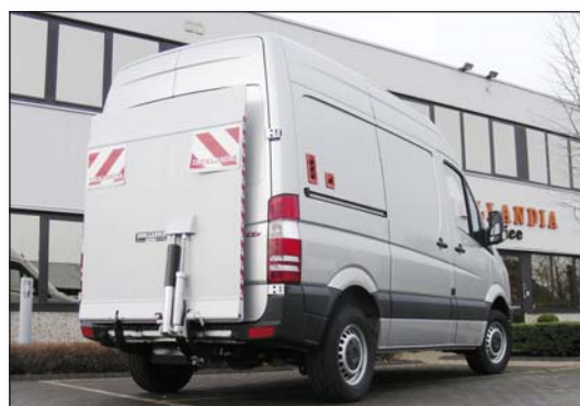
DH-LSP 300-500 kg