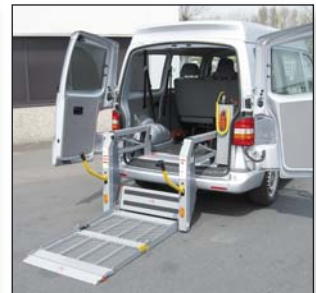
S957 Foldable platform for reduction in required fitting height, and for maximum driver's view through the rear vehicle doors (model shown = DH-P20, DH-P21 is excl. safety gates)