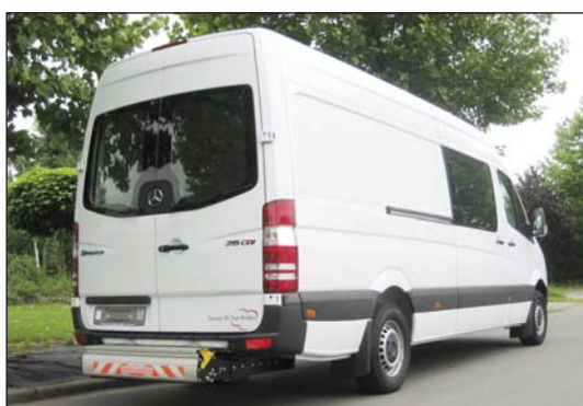
DH-C 350 kg