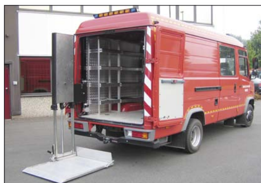
DH-VZ 300 kg