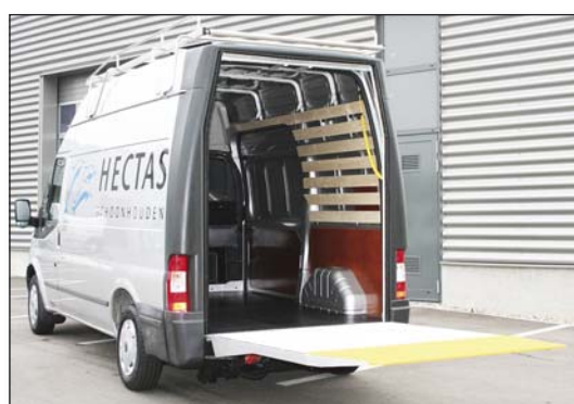
Option S604 Without rear doors