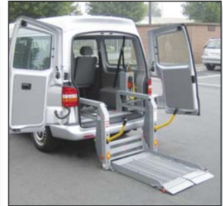
S953 Vertically folding platform for clear and free passage through the doorway (model shown = DH-P20, DH-P21 is excl. safety gates)