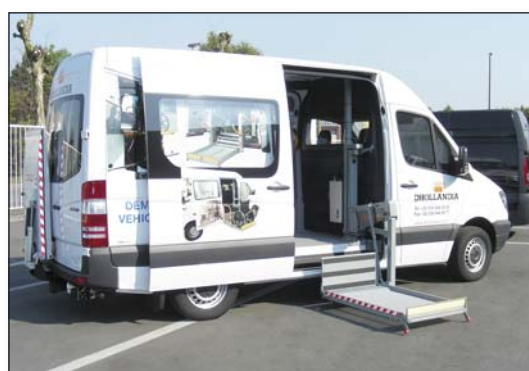
DH-P11 250 kg