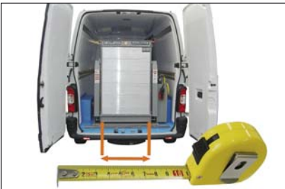
S958 Non-standard platform width