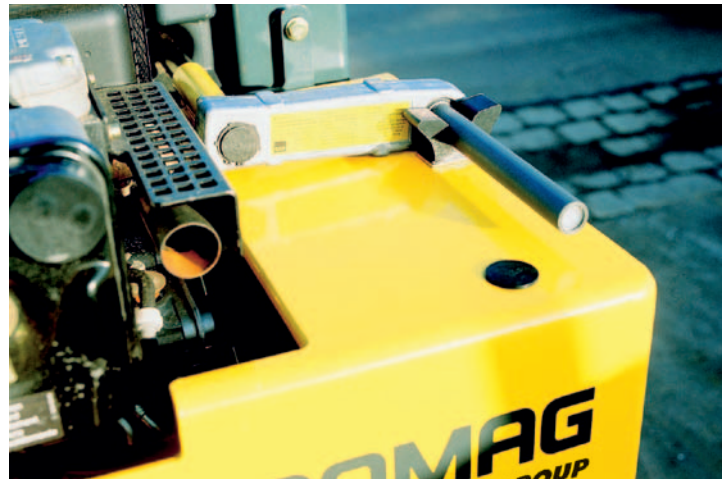
Electric start and crank handle are standard items which minimise down-time risks.