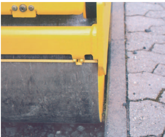
Side clearance allows precise rolling especially at mat edges.