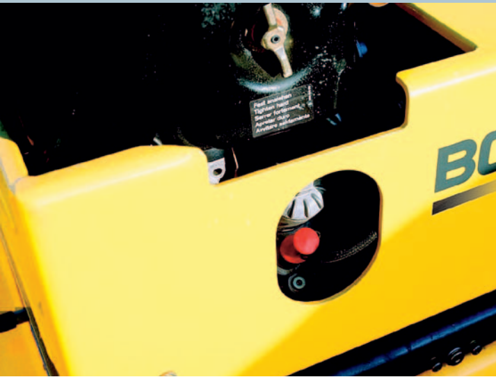
Cheap to run with fast easy-access servicing.