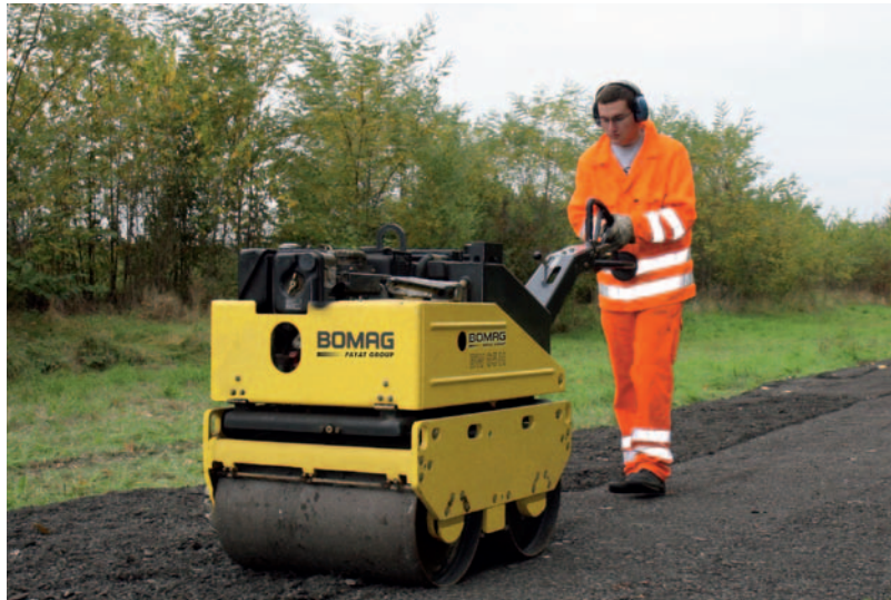
... and earthworks.