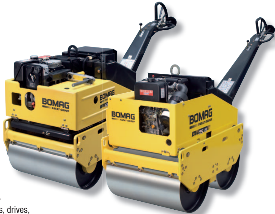
BOMAG BW 65 H and BW 75 H. Featuring the unique double vibratory system.

Hydrostatic travel drive produces easy handling, smooth speed control and high top travelling and working speeds.