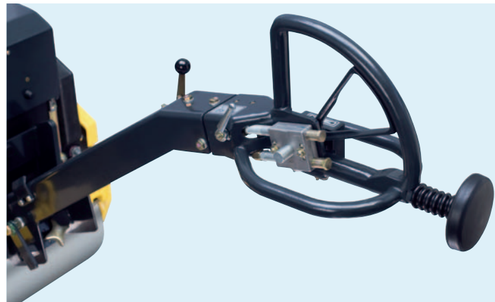
The CE-compliant and height adjustable steering rod offers ultimate safety and ease of operation.