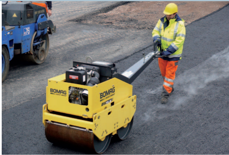
Consistent compaction results on asphalt ...