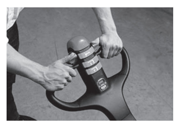
Easily operated by both left and right-handed users