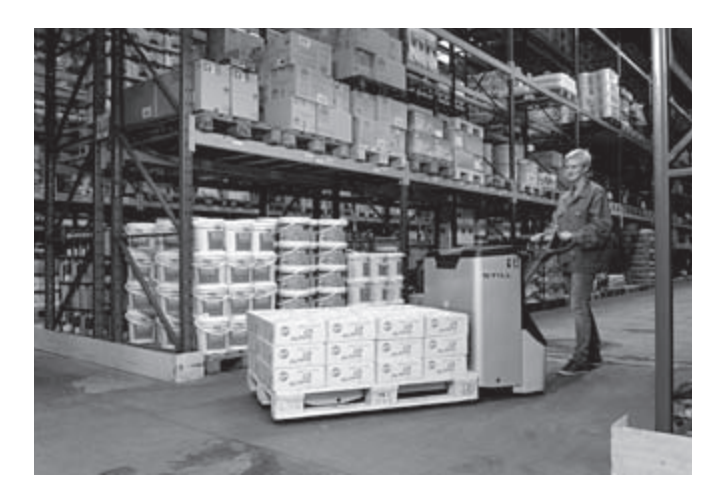
The ECU is right at home transporting goods horizontally for industry, trade and commerce