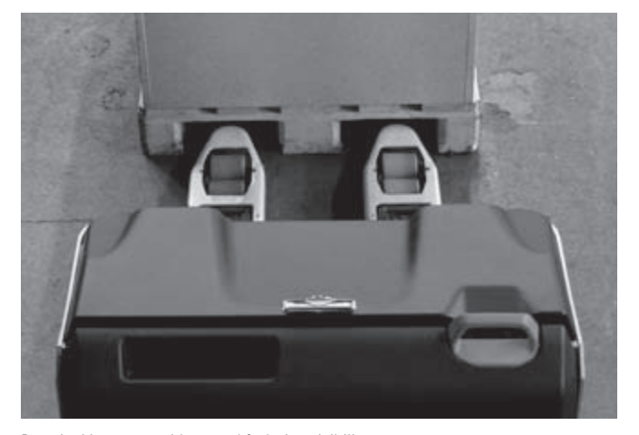
Practical layout provides good fork tips visibility