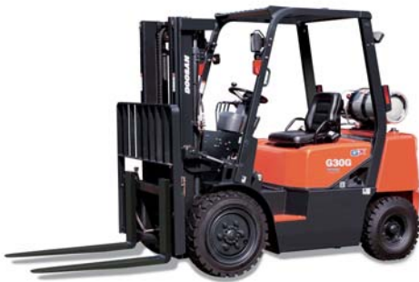
G20G / G25G / G30G 2,000kg 2,500kg 3,000kg Gas, LPG, Pneumatic Tire