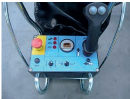
Sturdy, simple and intuitive control box on platform