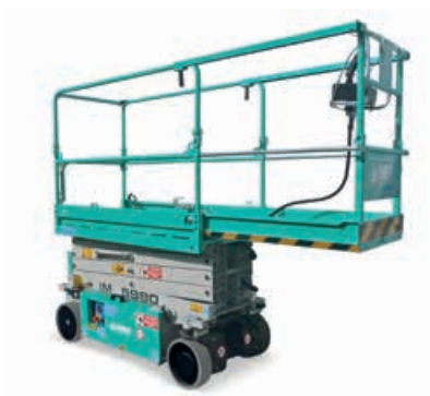
Manual deck extension 1 m