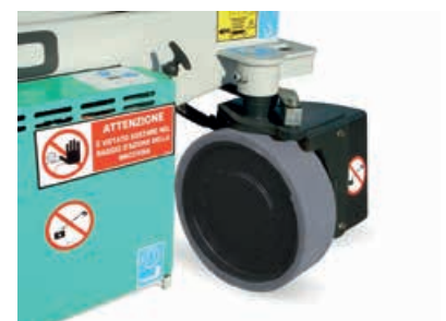
90° wheel steering