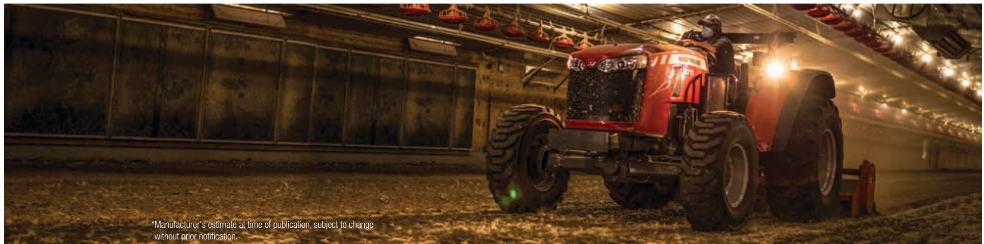
*Manufacturer's estimate at time of publication, subject to change without prior notification.